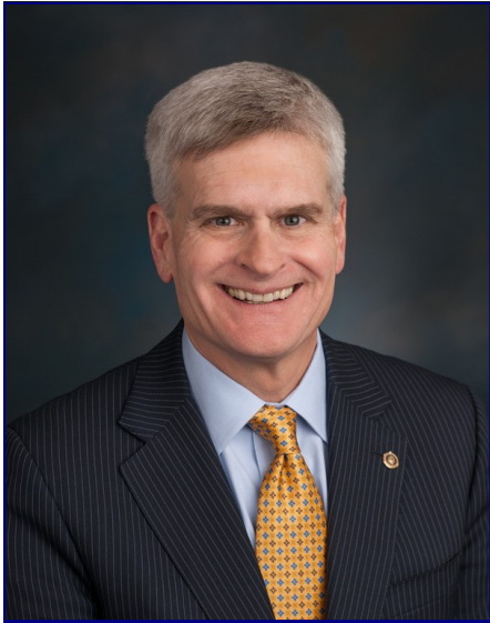
Senator Bill Cassidy

For nearly three decades he has provided care for uninsured and underinsured patients in Louisiana's charity hospital system. He co-founded the Greater Baton Rouge Community Clinic, providing free dental and health care to the working uninsured. He created a private-public partnership to vaccinate 36,000 children against Hepatitis B at no cost to the parents. In the wake of Hurricane Katrina, Bill led a group of health care volunteers to convert an abandoned K-Mart building into an emergency health care facility, providing basic health care to hurricane evacuees.